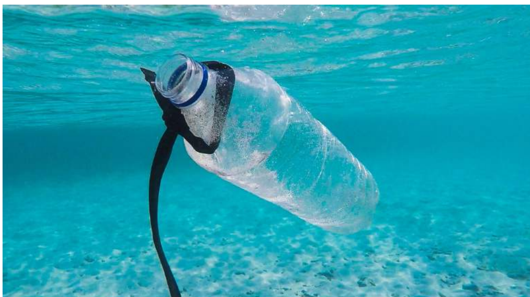
PET bottle that has leaked in the Ocean - Gili islands, Indonesia